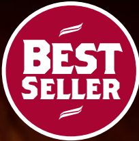
THE ELVES' CHOICE #15

A SAMPLING OF OUR SUMMER SAUSAGES COMPLEMENTED BY THREE CLASSIC CHEESES.