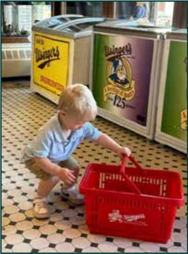
Never too young to shop at Usinger's.